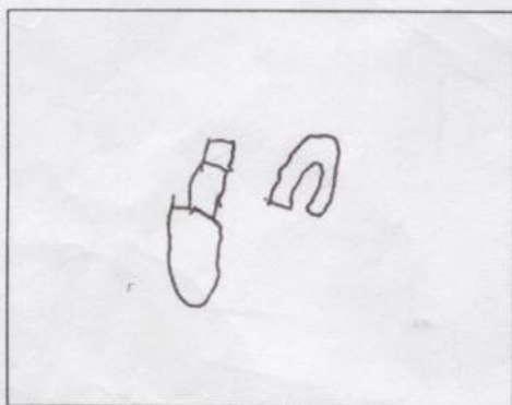
Caption: USB Flash Drive

Picture Walk: What predictions can you make about content based on visuals?